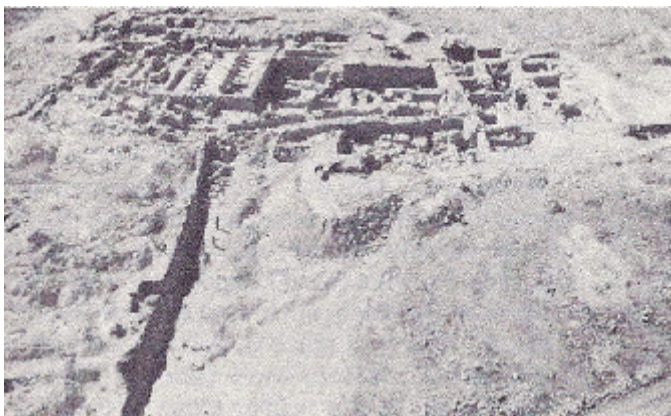
Hazor. Joshua defeated King Jabin of Hazor during the conquest of Canaan (Josh . 11 :1-13; 12:19). King Solomon later fortified the city, but the Assyrians destroyed it in the eighth century B.C. and carried away its people (1 Kings 9:15; 2 Kings 15:29). From 1955 to 1958, Israeli archaeologists led by Yigael Yadin excavated the ruins of Hazor, just northwest of the Sea of Galilee .

Helkath-hazzurim ("field of rock"), an area of smooth ground near the pool of Gibeon (2 Sam. 2: 16).