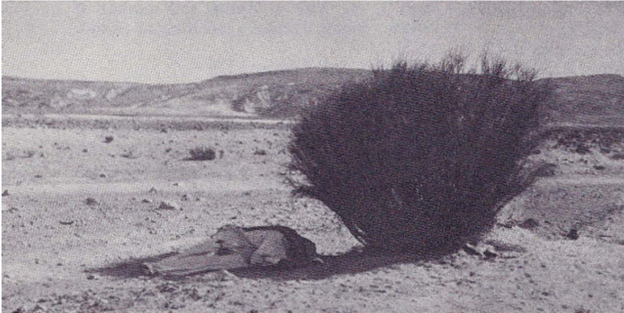
Traveller's rest, Kadesh. An Arab traveller dozes beneath a broom bush in the wilderness along the Negev Desert. In this same area Elijah stopped to rest beneath a juniper tree and received encouragement from an angel of the Lord (1 Kings 19:4-7).

Elihu ("God himself"). [1] One who joined David at Ziklag (1 Chron. 12:20). [2] A porter at the tabernacle at the time of David (1 Chron. 26:7). [3] The youngest "friend" of Job (Job 32:2,4-6). [4] See Eliab [3]. [5] See Eliab [4].